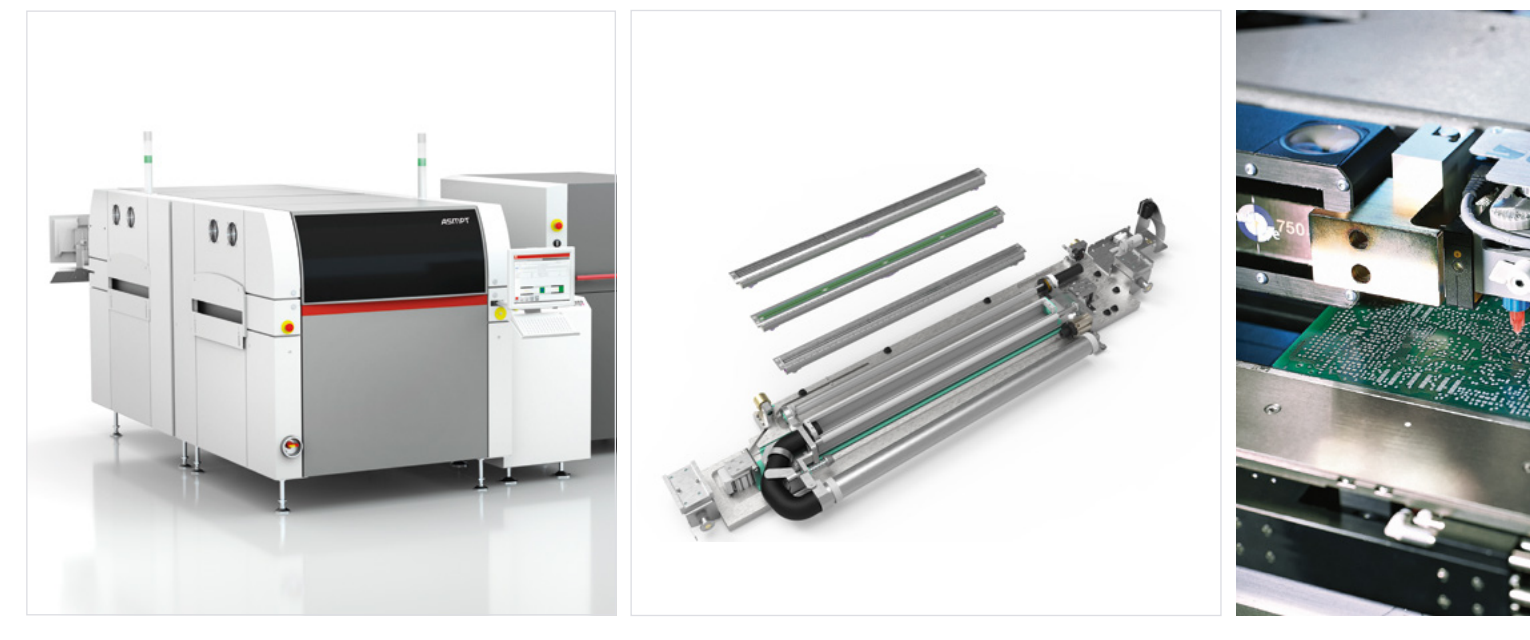
DEK NeoHorizon Back-to-Back dual-track solution