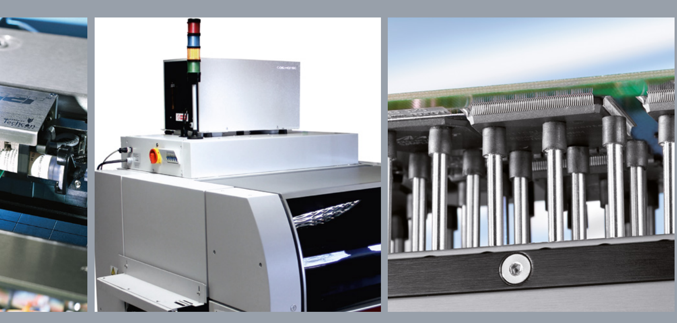
DEK NeoHorizon with Temperature Control Modul (DEK TCM