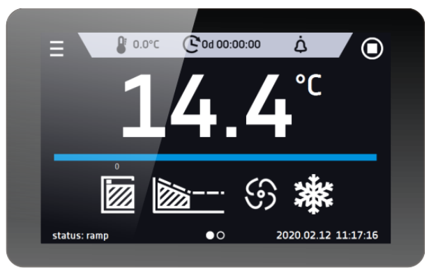
Smart - preview screen